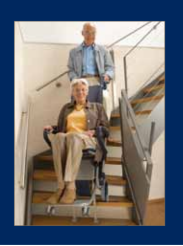
Escalino also masters winding stairs safely and comfortably.

This innovative climbing aid overcomes stairs practically all by itself. The climbers provide steady and secure footing and do not damage the edges of steps. At a standstill and slightly extended climbers the device's seat is lifted so you can easily get on or off it. Thanks to its big wheels and climbers the escalino can also be used on grating stairs.