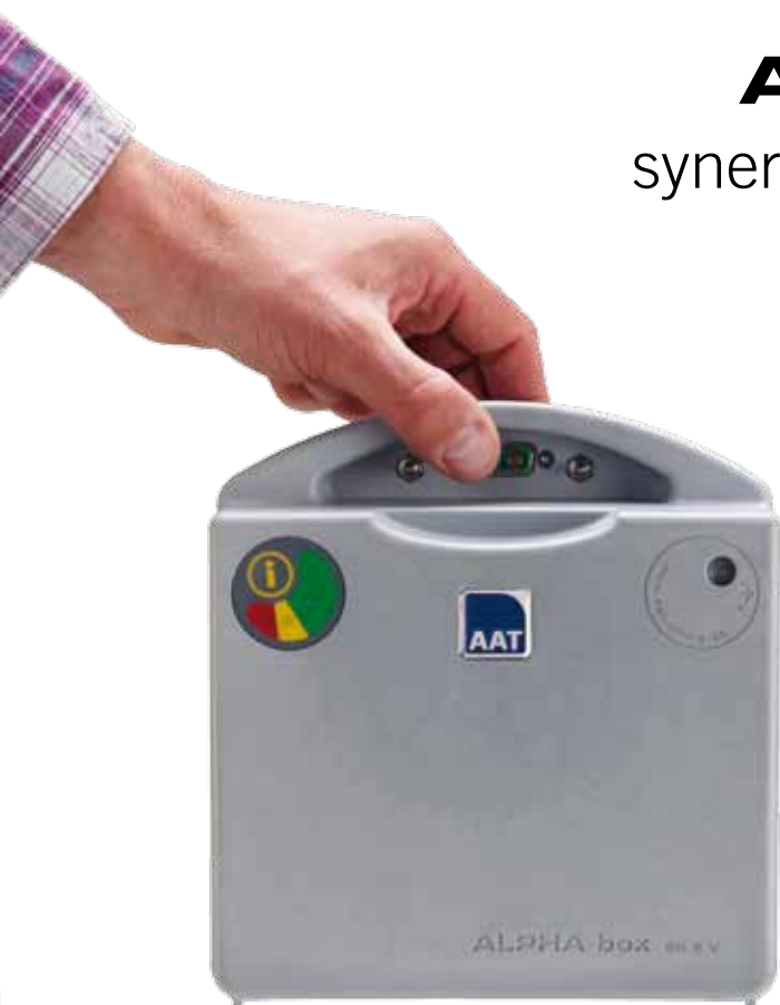
Extremely lightweight and efficient