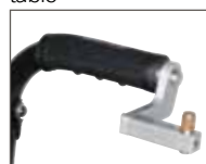
Holding device for the attendant's control unit