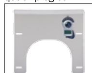
Installing the therapy table