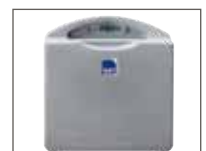
Lead silicone battery pack