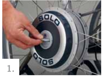
1. Unlock wheel