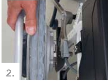
2. Remove wheel