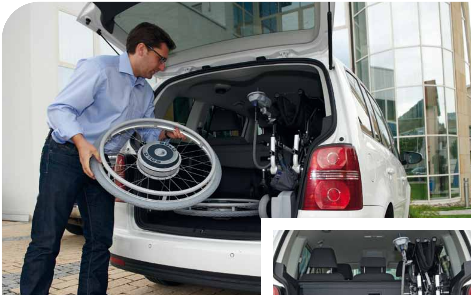
The powered wheels without stud axles make storage particularly easy and space-saving