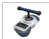
Special fixture for quadriplegics