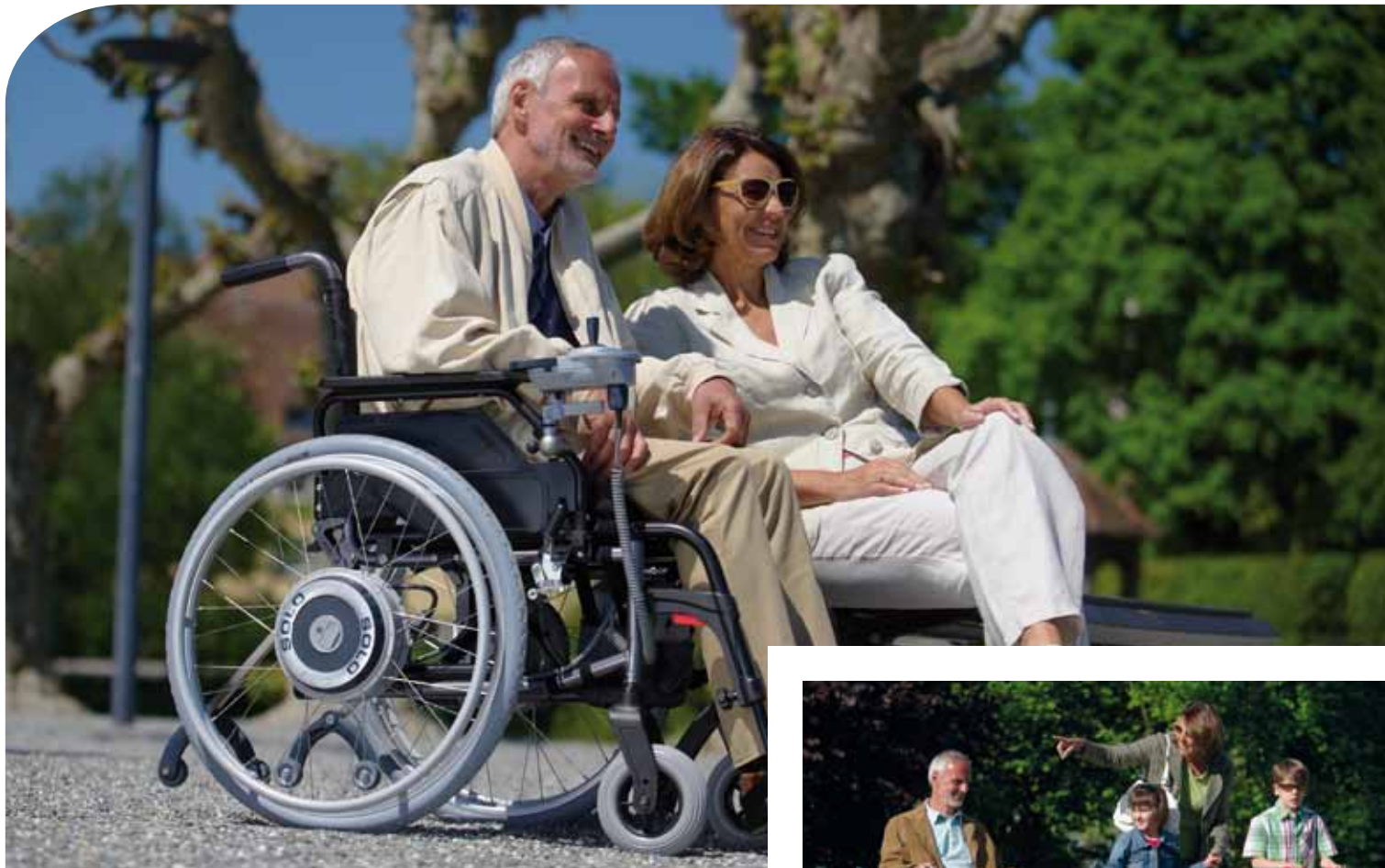
Easygoing on your way