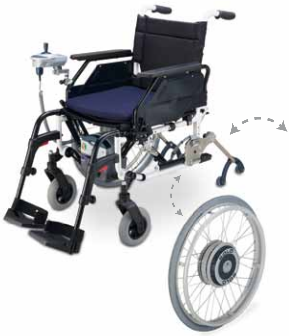
The wheels are exchanged effortlessly and quickly.