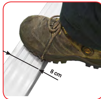
Large steps mm 80