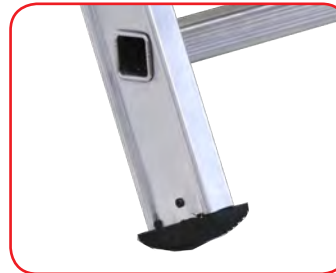
Pvc rubber feet