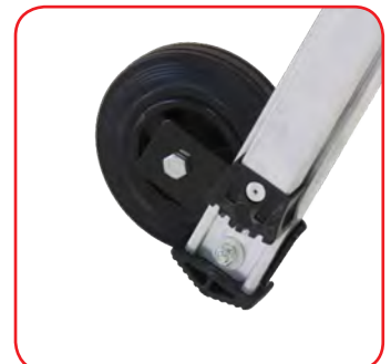
Wheels Ø 150 mm