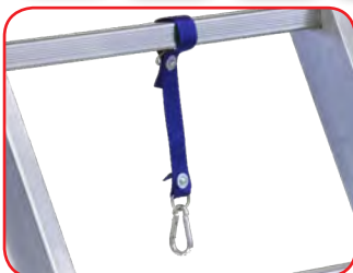
Anti-opening belt for transport