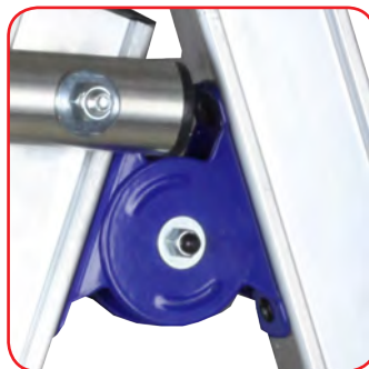
Large painted steel hinges