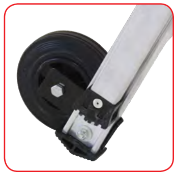
Wheels Ø 150 mm