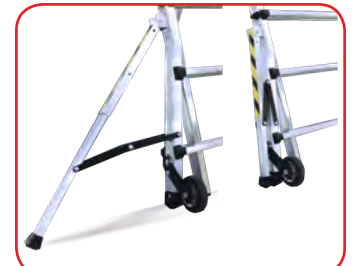
Foldable telescopic outriggers