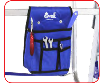
Including bag tools holder