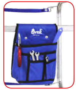
Including bag tools holder