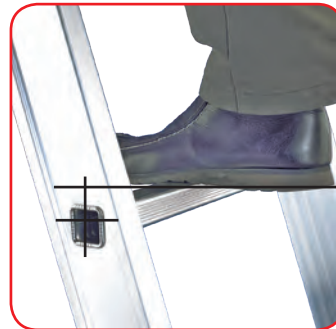
Flanged, ribbed ergonomic rungs