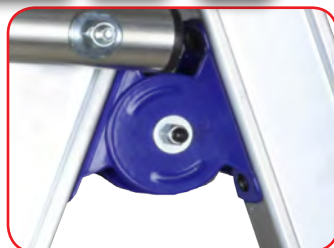
Large painted steel hinges