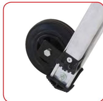
Wheels Ø 150 mm