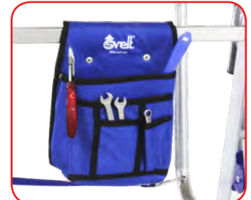
Including bag tools holder