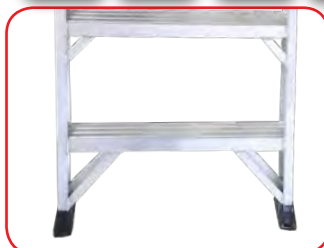
Reinforcements on all step