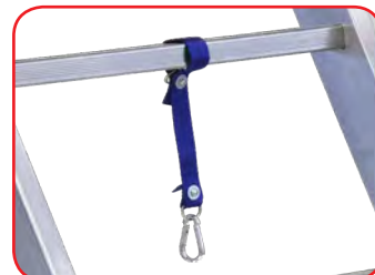
Anti-opening belt for transport