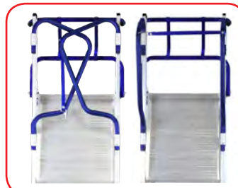
Foldable patented guardrails