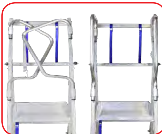
Foldable patented guardrails