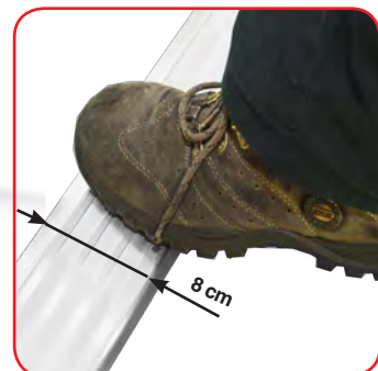
Large steps from mm 270 to mm 134