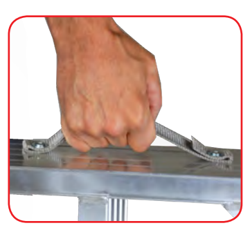
Patented handle for easy transport available from June 2019