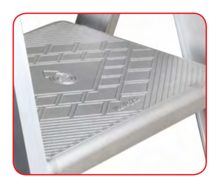
Optional aluminium platform with safety Closed cm 14 hook (standard on Marea Tech)

Aluminium stepladder with platform and guardrail. Suitable for use in the home and DIY. It is made of a high resistant extruded aluminium alloy. The extruded rectangular (50x25 mm) aluminium frames are ergonomic for easy gripping. Ergonomic anti-opening hinges in light die-cast aluminium give further stability to the whole structure.