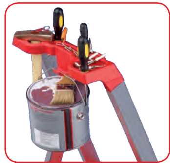
Ergonomic handle/tools holder for easy climbing