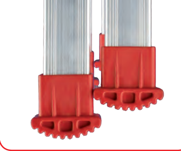
Rubber feet with maximum grip on the ground