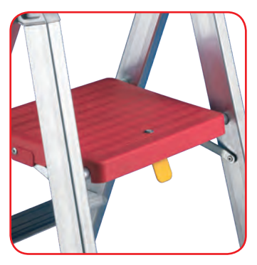
Standard reinforced plastic platform with safety hook (cm 25,5x30)