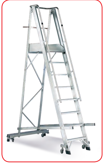
On demand: Castellana 4WD (with 4 spring selfblocking wheels)