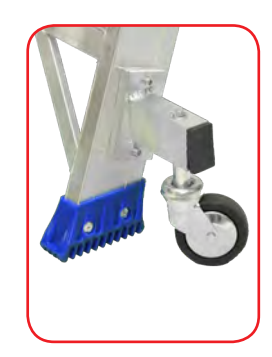
Note: Due to the spring wheels during the climb, descent and movement of the operator, the ladder can have a very slight tilting effect that does not preclude either good operation or safety