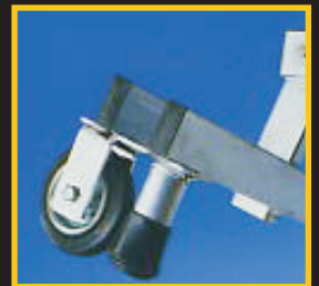
Quality braking system