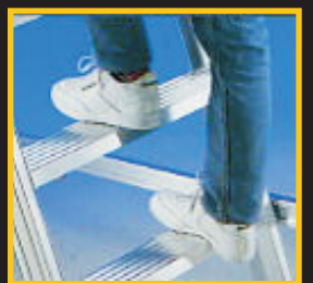
Non-skid step: 10 cm large