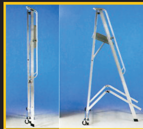
Easy folding for transportation