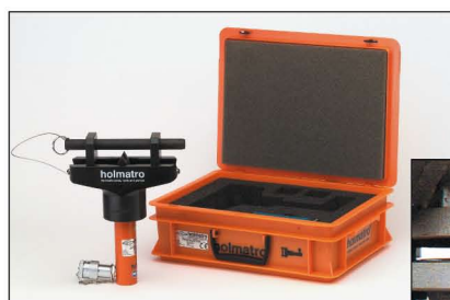
FLS 170 NU