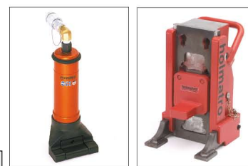
TJ 8 S 13