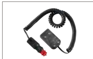
Charging cable for the car Available for 12V and 24V.