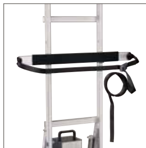
Support for washers and dryers Holding device plus strap, can be adjusted from 510 mm to 630 mm, to secure wide goods for transportation.