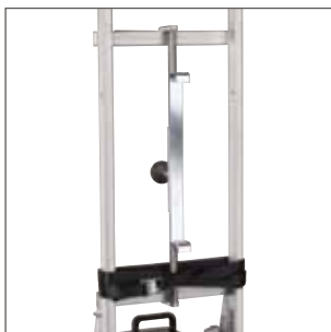
Holding device for grocery boxes To secure grocery boxes.