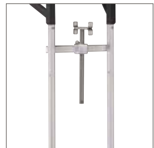
Hook for crates Holding device for crates.