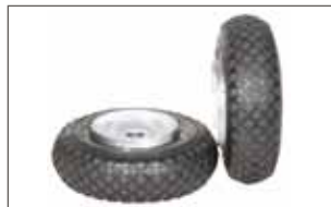
Pneumatic tires Pneumatic tires are available as an option.