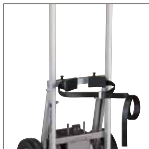
Support for round containers Approx. 150mm to 800mm in diameter.