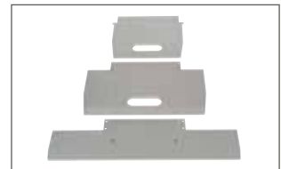
Toe-plate variety Diverse assortment of toe-plates, custom-made versions are also available.