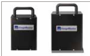
Battery pack/mega battery pack Extra battery pack for continually use or a battery pack with a greater capacity.