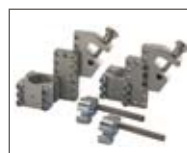
Brackets for the wheelchair