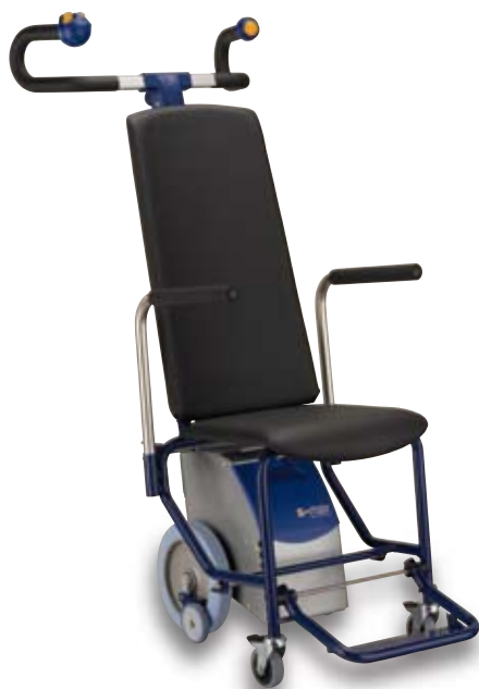
Transportation chair U3