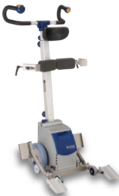
Universal rack SDM6

For a person who merely needs help climbing stairs the transportation chair U3 is the optimum solution. The chair is particularly narrow and thus suitable for very narrow stairways and even winding stairs.