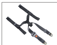
Seat belt system including hip belt